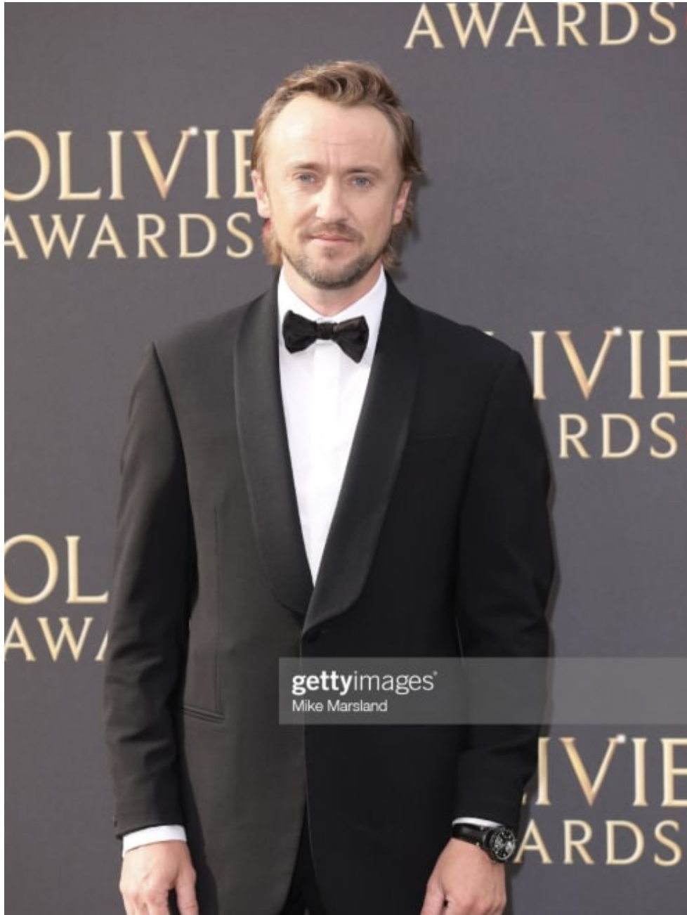
Holly Macnaghten Red Carpet