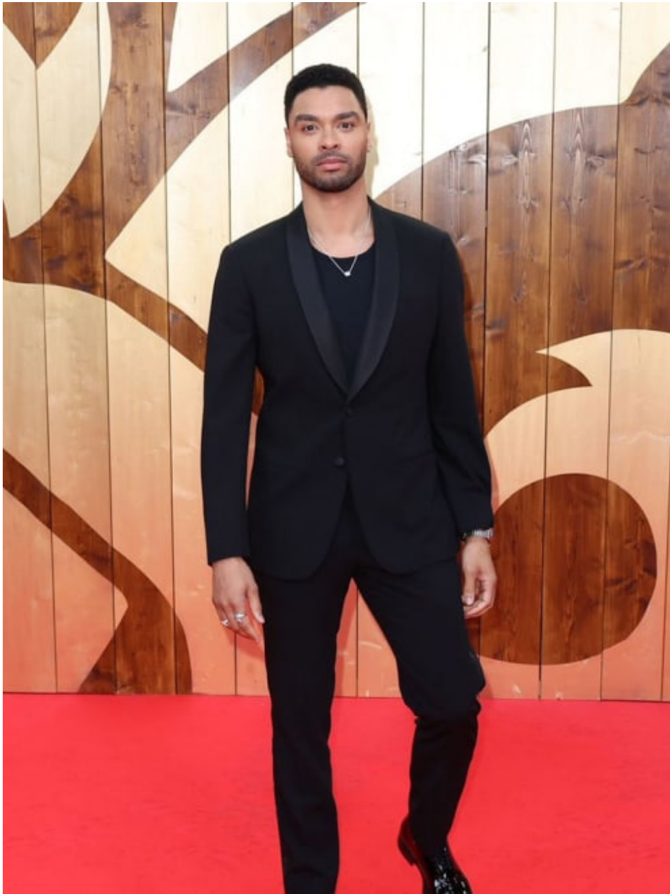
Holly Macnaghten Red Carpet