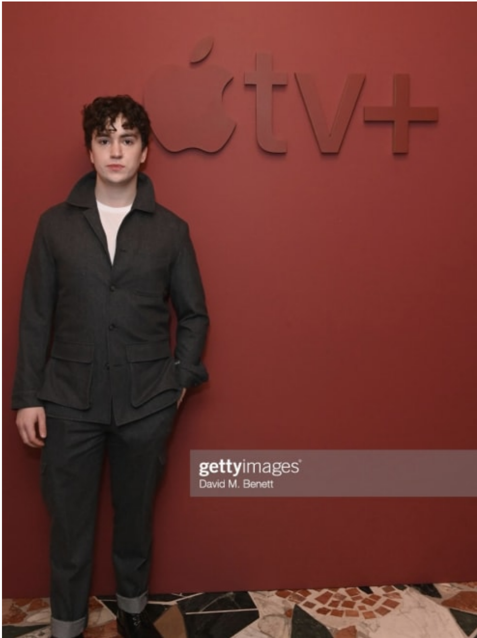
Holly Macnaghten Red Carpet