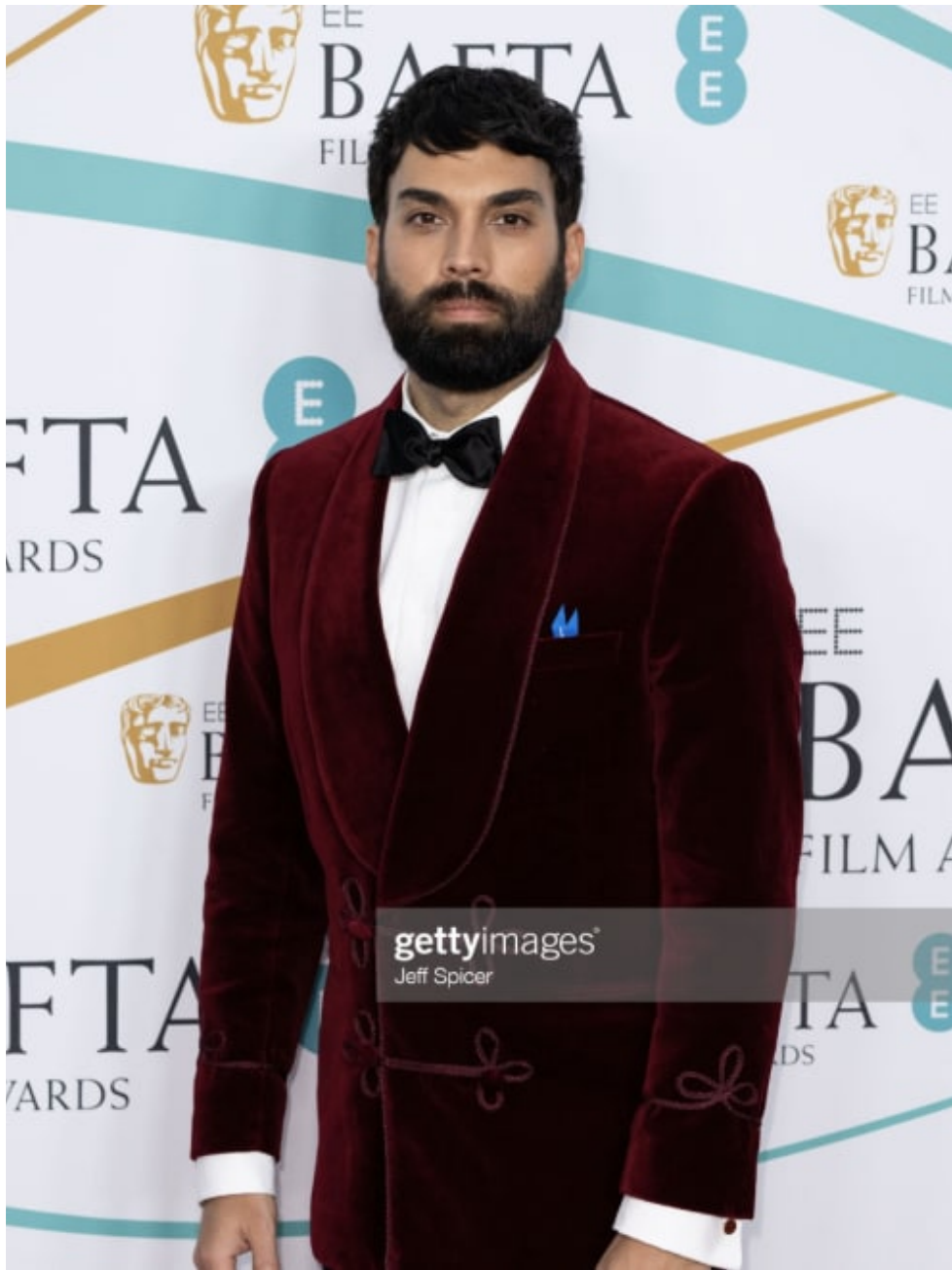
Holly Macnaghten Red Carpet