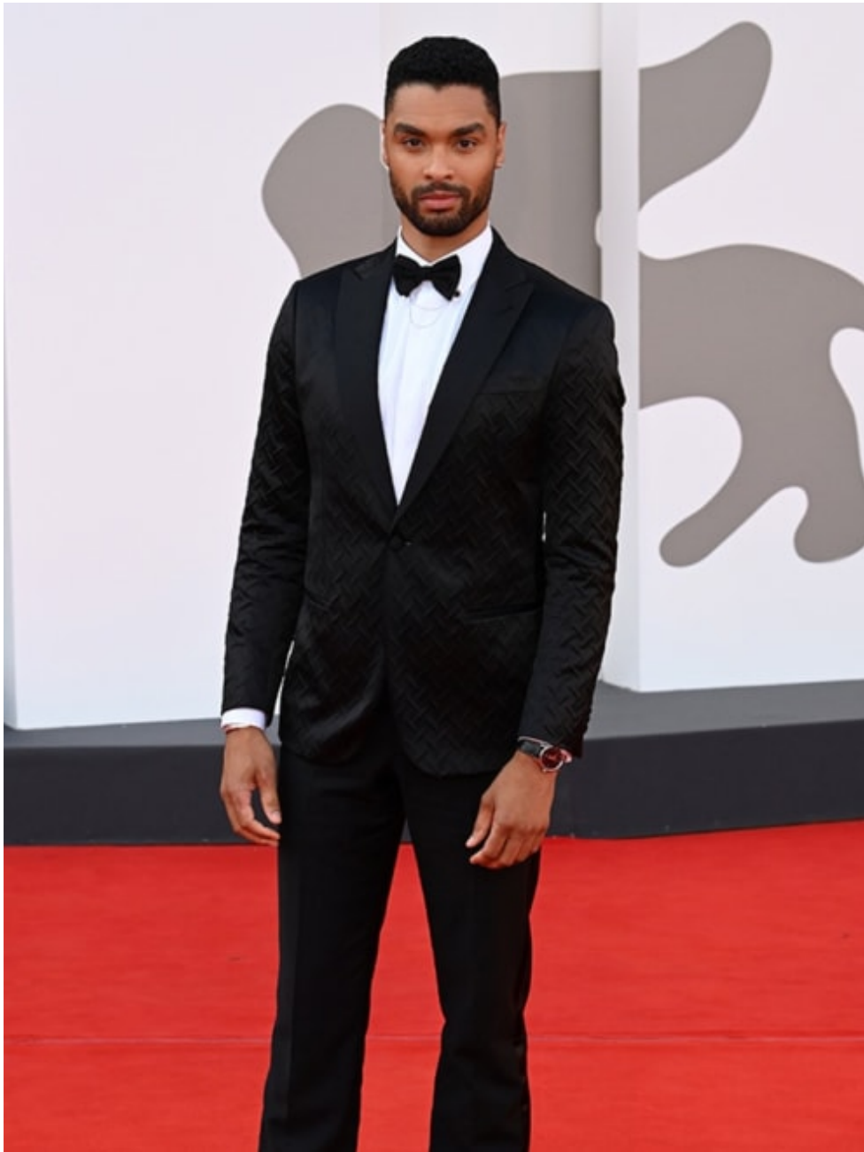
Holly Macnaghten Red Carpet