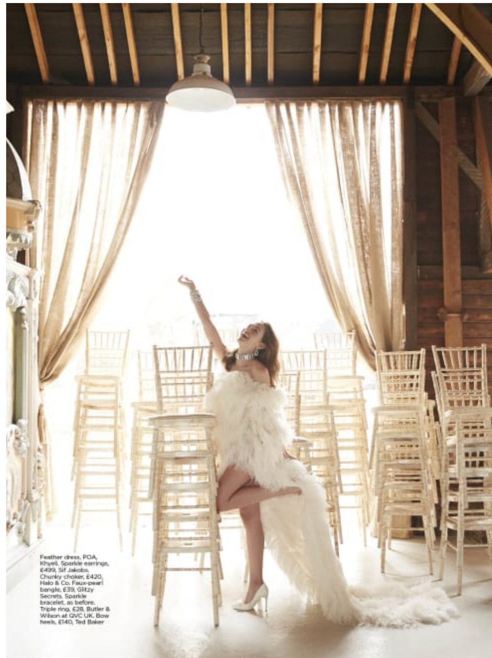
Feather dress, PDA, Khyell. Sparkle earrings, £499, St Jacobs. Chunky choker, £420, Halo & Co. Faux-pearl bangle, £99, Giltzy Secrets. Sparkle bracelet, as before. Triple ring, £28, Butler & Wilson at QVC UK. Bow heels, £140, Ted Baker