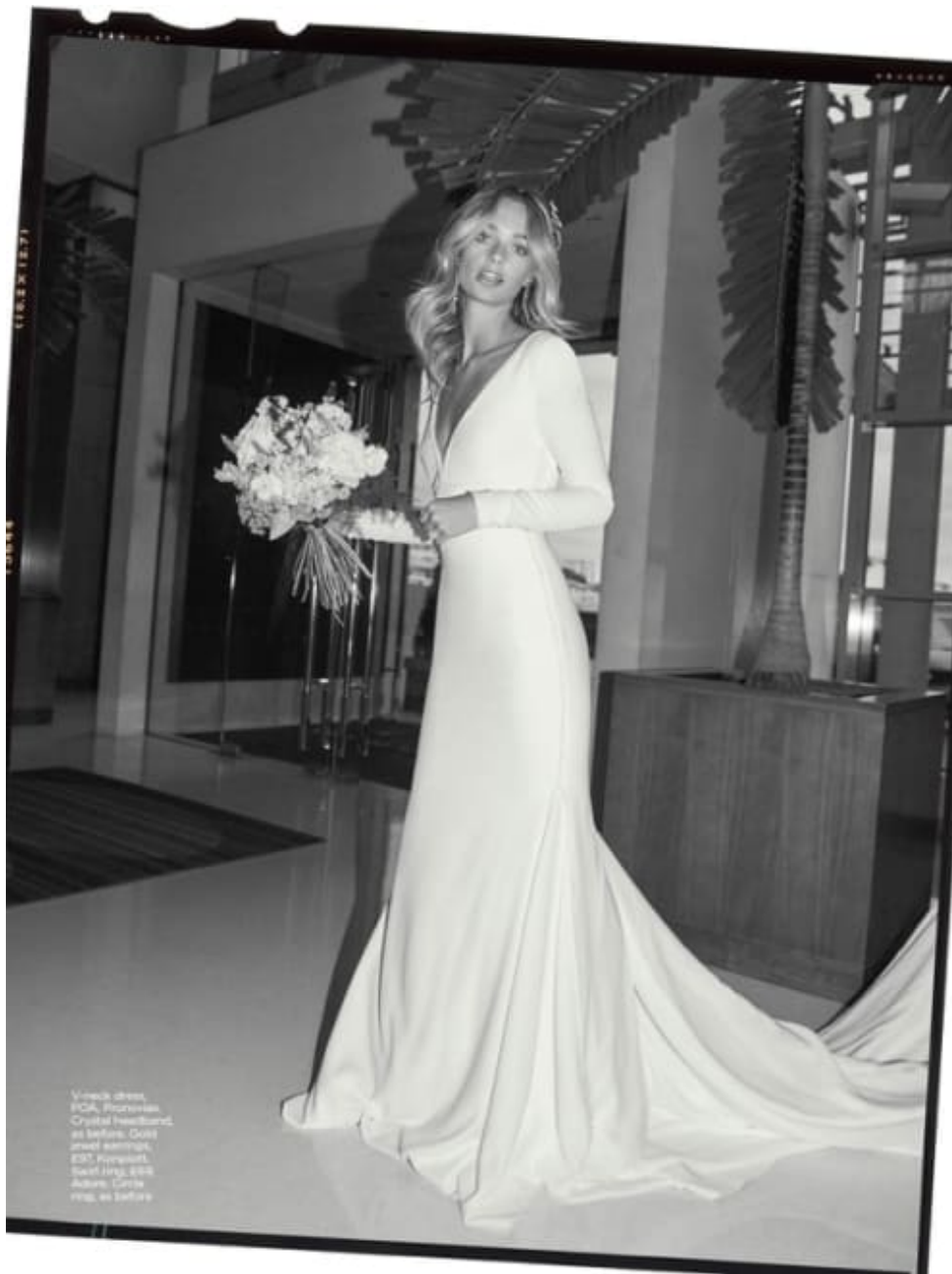
V-neck dress, PCN, Rochester. Crystal headbands, as before. Gold jewel earrings, EOT, Koppert. Sash, H&M. ERS Aston. Carve ring, as before.