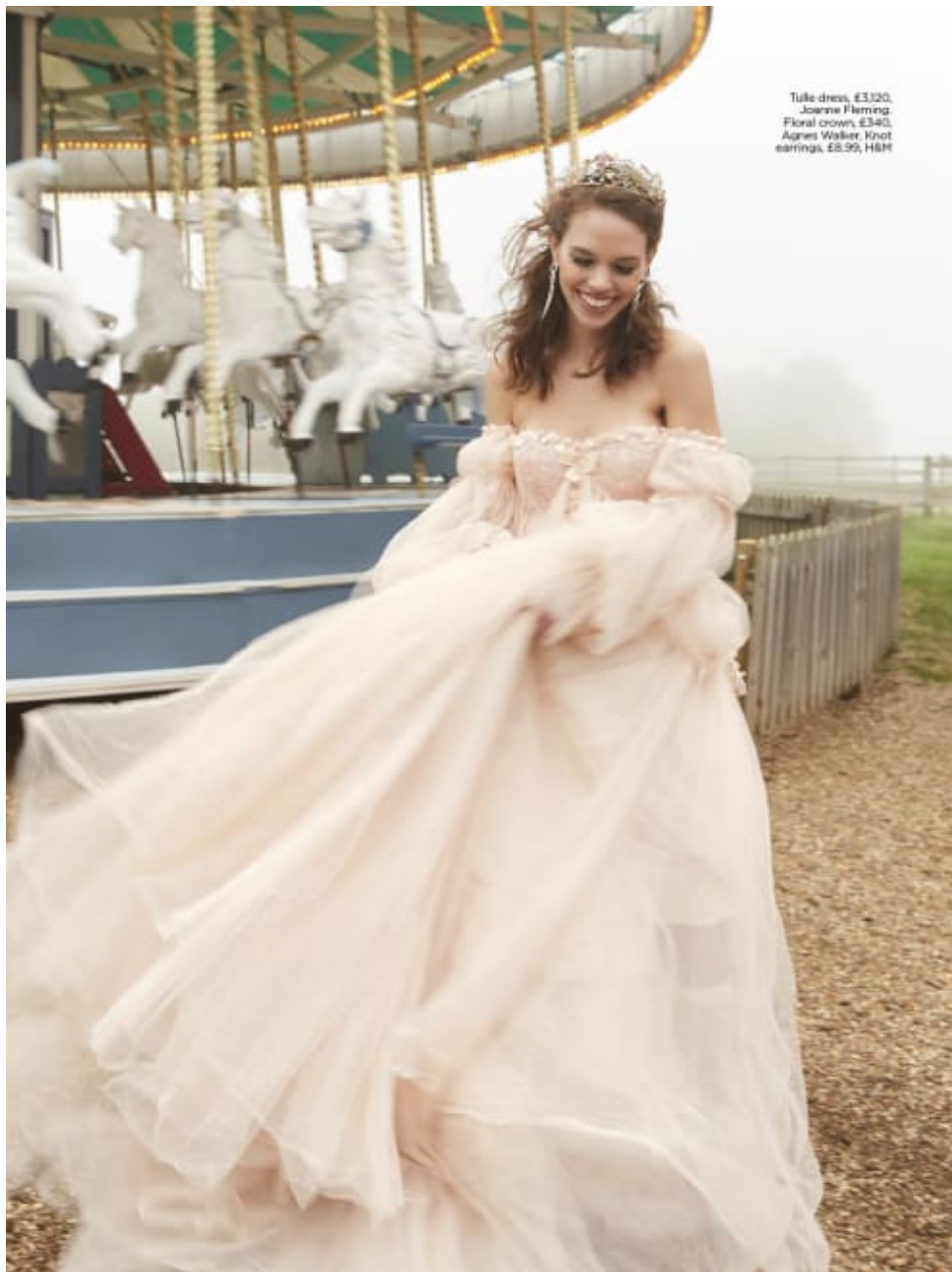
Tulle dress, £3,320, Joanne Fleming. Floral crown, £340, Agnès Walker. Knot earrings, £8.99, H&M