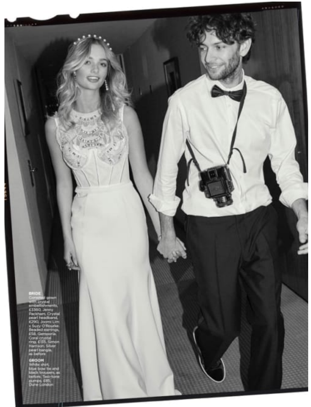
BRIDE Corset gown with crystal embellishments, £3500, Jenny Pacheco. Crystal pearl headband, £290, Jooni Lim & Suzy O'Rourke. Beaded earrings, £58, Gemstone. Coral crystal ring, £138, Simon Harrison. Silver pearl bangle, as before.