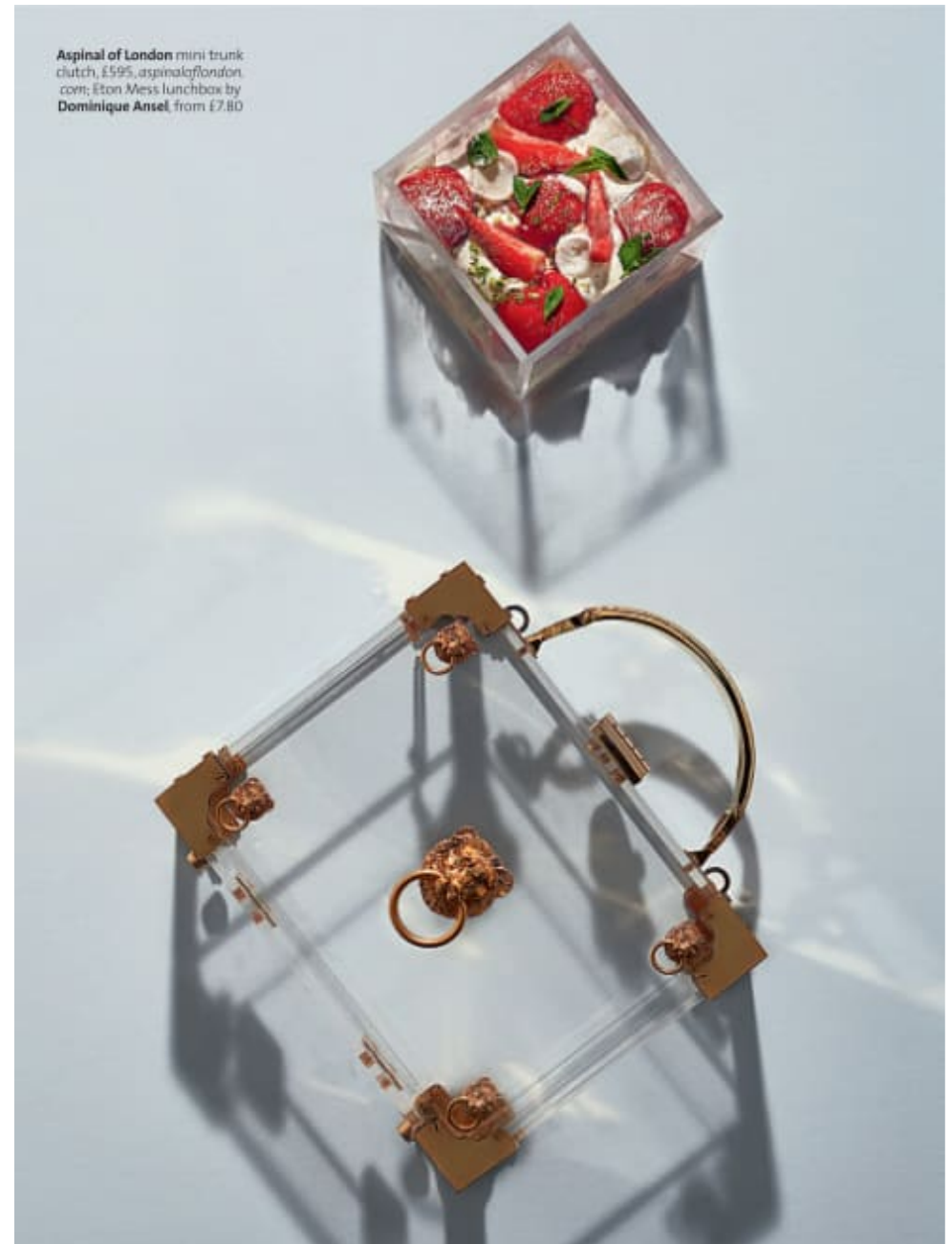
Aspinal of London mini trunk clutch, £595, aspinaloflondon.com ; Eton Mess lunchbox by Dominique Ansel, from £7.80