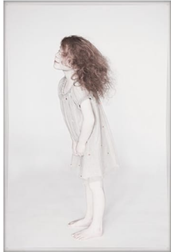
Bijeweled tulle dress, by Borpoint.