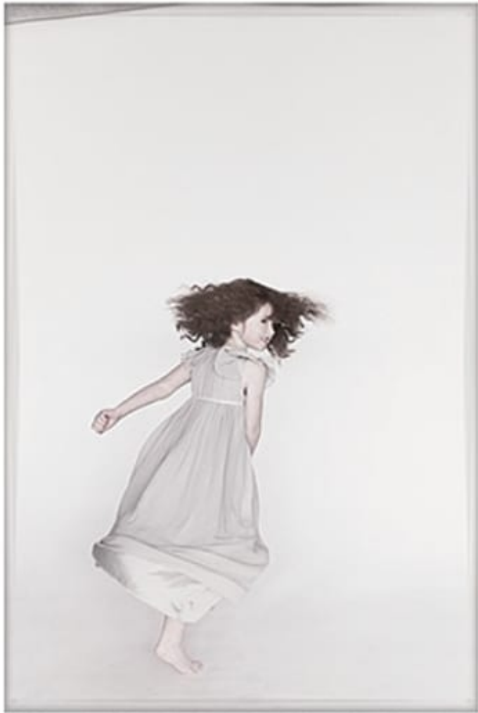
Pale grey empire line silk dress, by Marie Chantal.