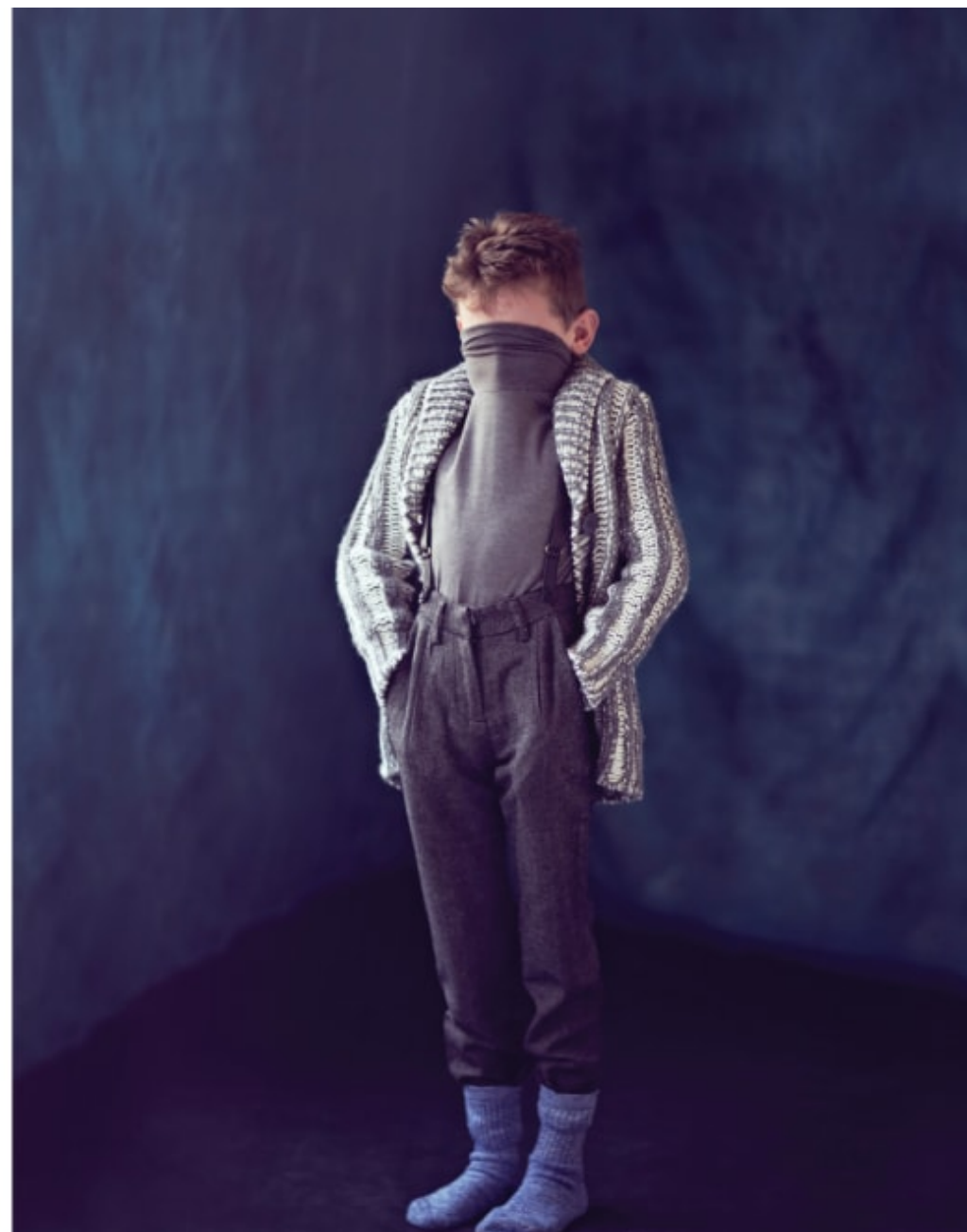
FROM LEFT: Grey jumper £23 by Cos (ages 2–6); faux leather skirt £12 by River Island (ages 3–12); socks from a selection at Next; grey legwarmers and bowler hat stylist's own • Navy and oatmeal striped jumper £19.99 (ages 2–14) and grey jumper £29.99, both by Zara (ages 2–8); blue trousers £52 by French Connection (ages 4–13); brown suede boots £35.99 by Zara (sizes 24–38); striped scarf £19 by United Colours Of Benetton • Grey roll-neck top £10.99 by Zara (ages 2–8); knitted grey and white cardigan £43 by United Colours Of Benetton (ages 18 months–7 years); grey trousers with leather braces £19.99 by Zara (ages 2–14); blue ribbed socks from a selection at Next GROOMING: Carol Morley; SET DESIGNER: Stephanie Kevers; MOODS: Reis and Sophia at Grace And Gabri.