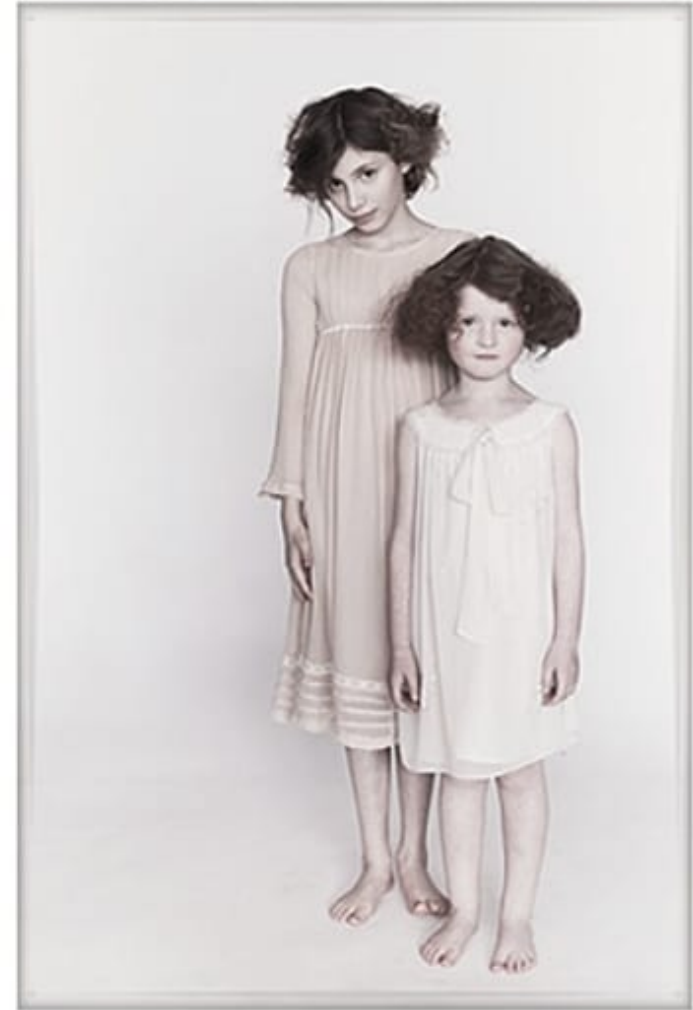
LEFT / Peach forget-me-not chiffon dress, by lovegorgeous. RIGHT / Flesh coloured tie neck and raw edge dress, by Bonpoint.