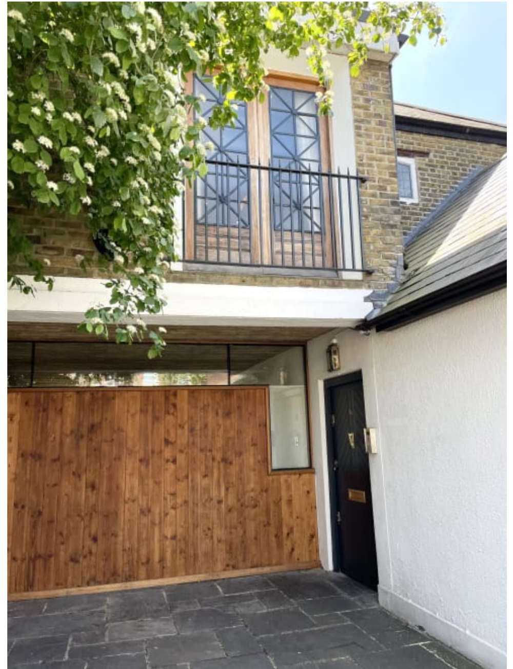
Vestry House NW10