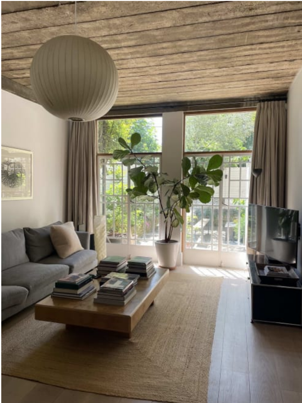
Vestry House NW10