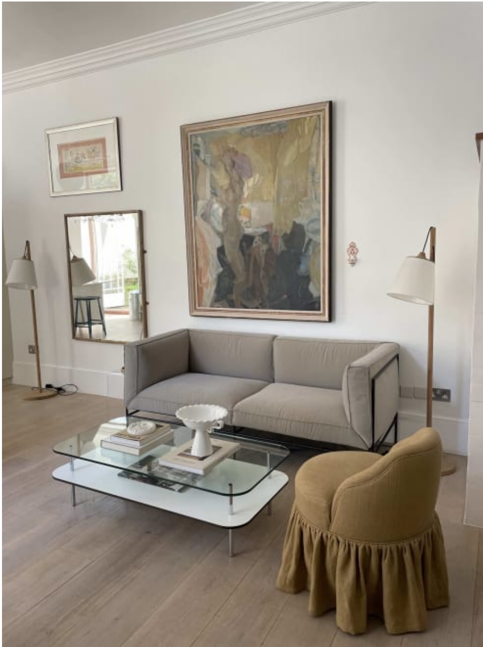
Vestry House NW10