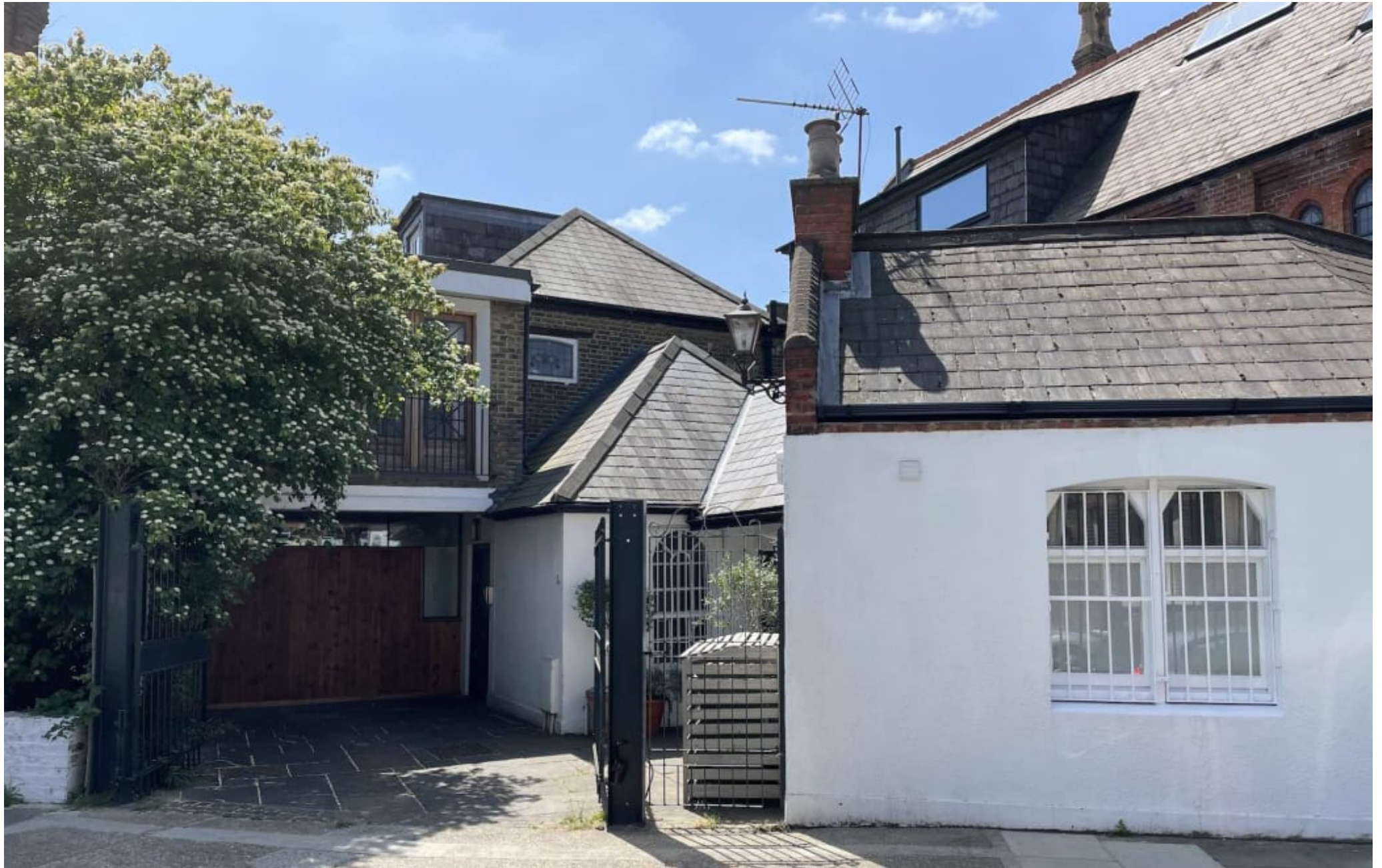
Vestry House NW10