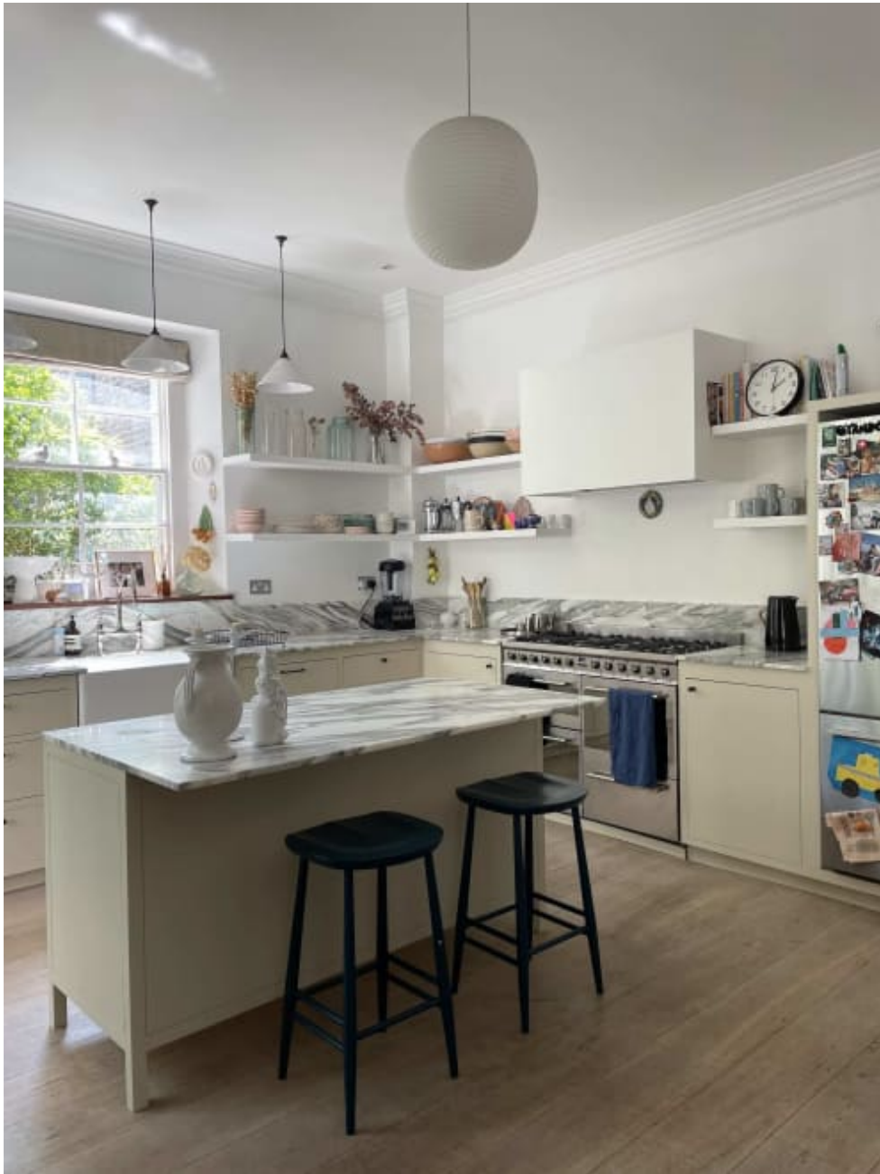
Vestry House NW10