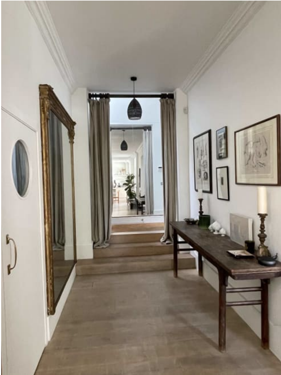
Vestry House NW10