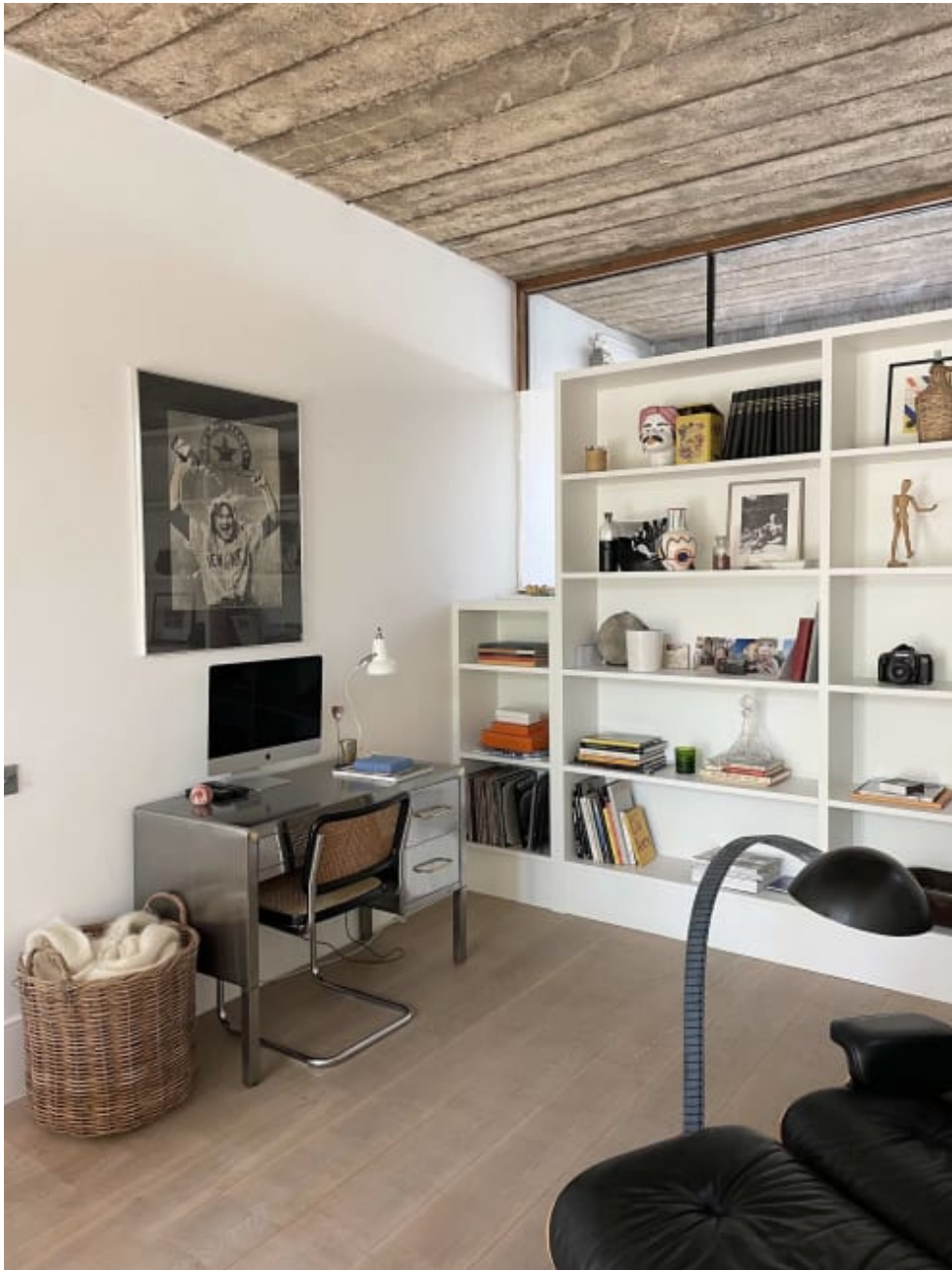
Vestry House NW10