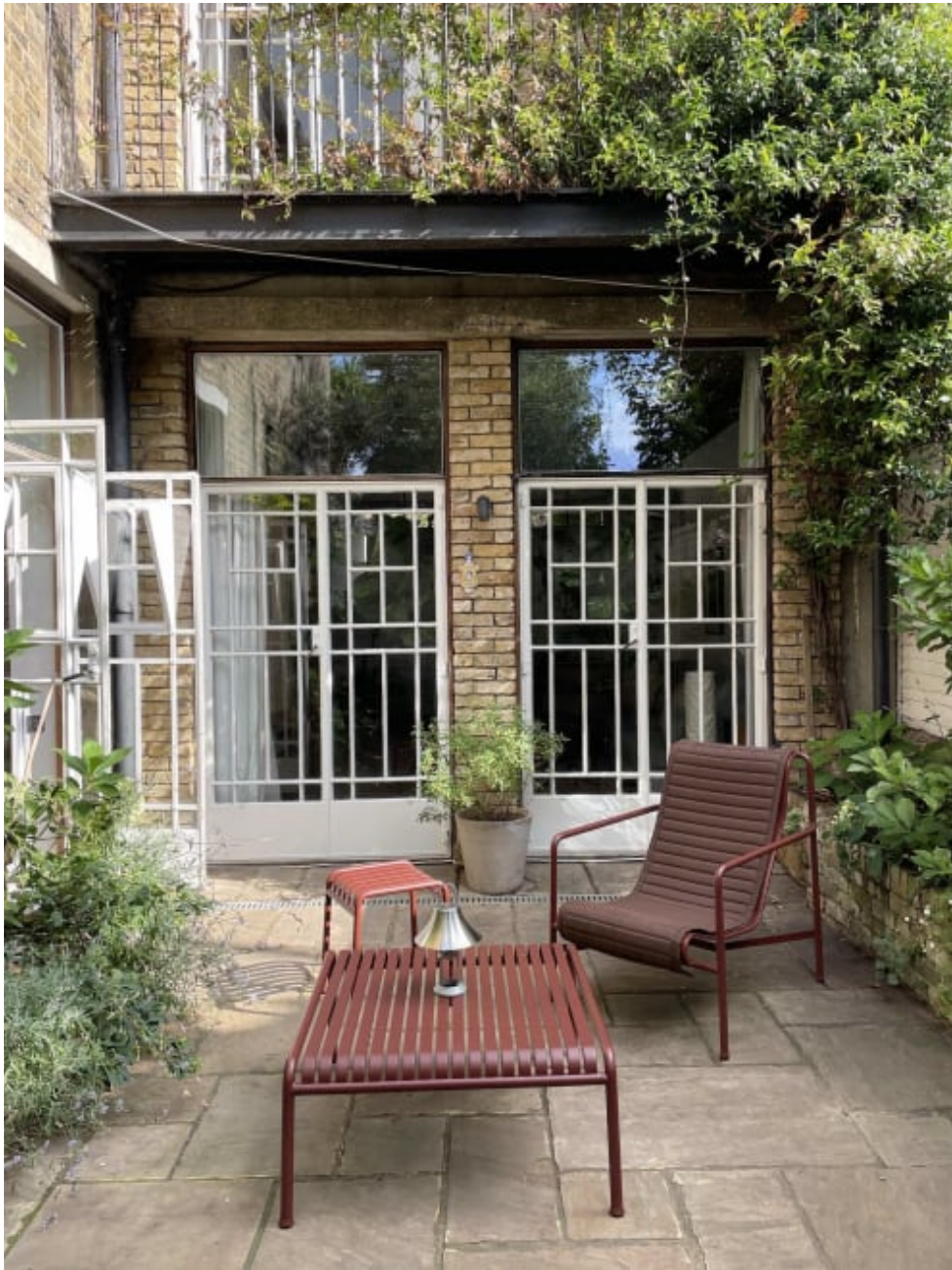
Vestry House NW10